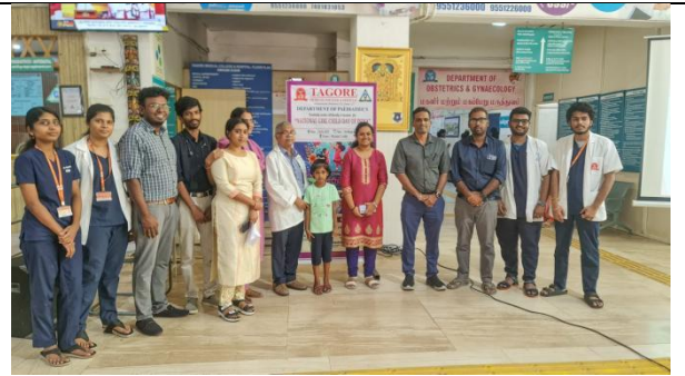
Geotag and/or caption with date