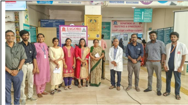
Geotag and/or caption with date